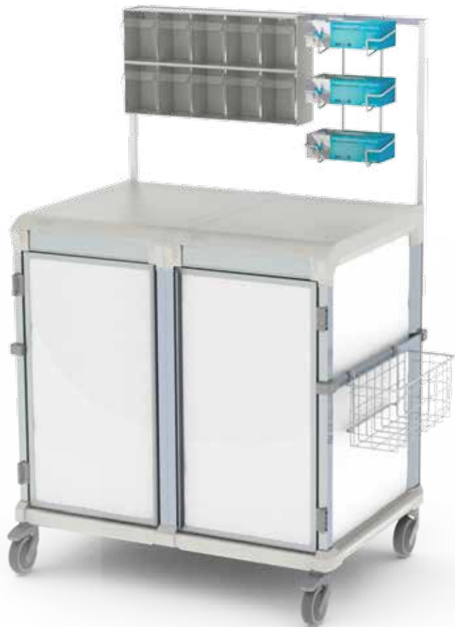
UU DOUBLE CART APL-2.0UU-SD