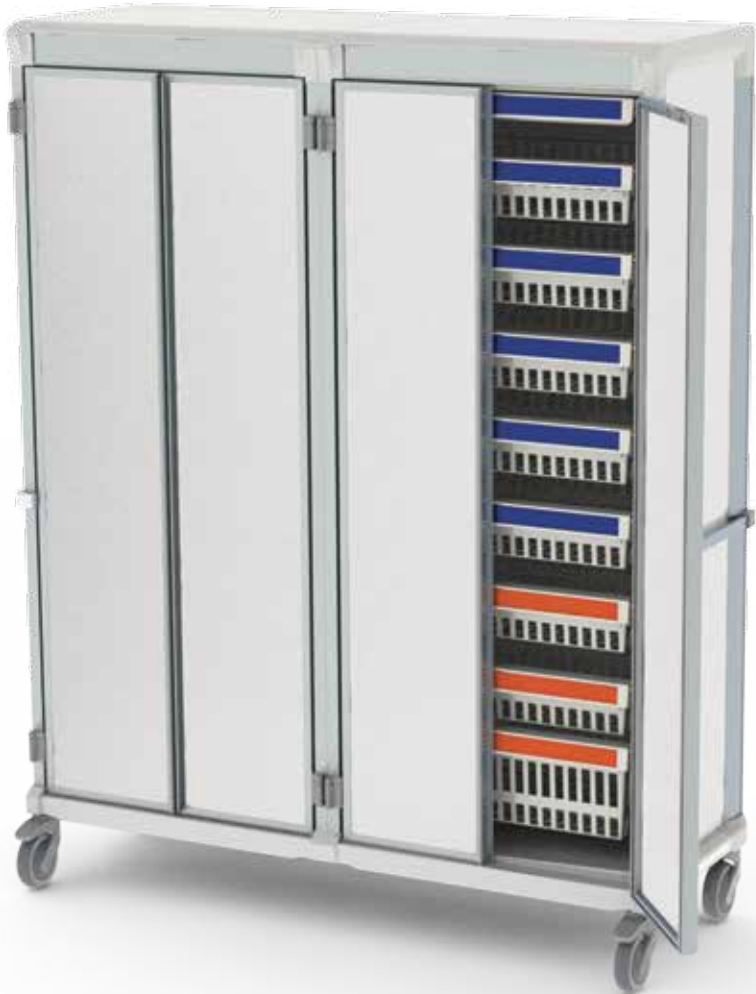
EE DOUBLE CART APL-4.0EE-SD

Solid door carts are offered in different heights from 108cm (42.5") to 209cm (82.5")