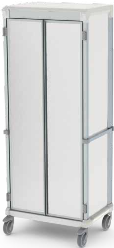
E SINGLE CART APL-4.0E-SD

SOLID DOORS ARE USED IN SPACES POPULATED WITH NON-MEDICAL STAFF, LIMIT PATIENTS' AND VISITORS' EXPOSURE TO THE MEDICAL STORED PRODUCTS